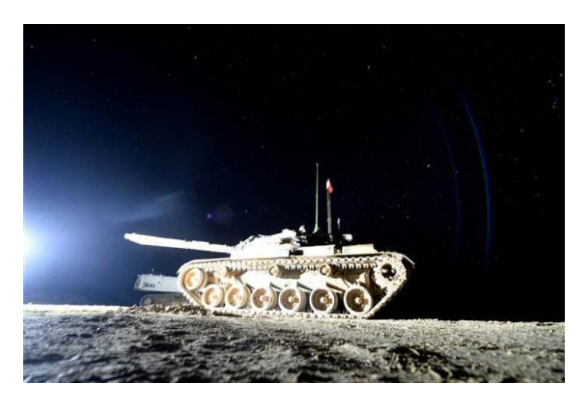
M-60A3 main battle tank from the 20^{th} Armored Brigade during the relocation of the Tomb

http://www.hurriyet.com.tr/gundem/29441095.asp, Accessed on: July 3, 2015