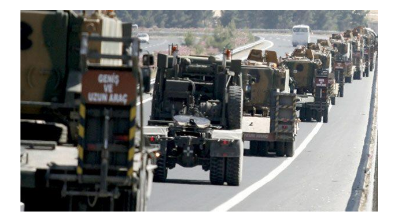
(Armored and mechanized deployments of the 5<sup>th</sup> Armored Brigade to frontier battalions)

http://www.hurriyet.com.tr/gundem/29441095.asp, Accessed on: July 3, 2015