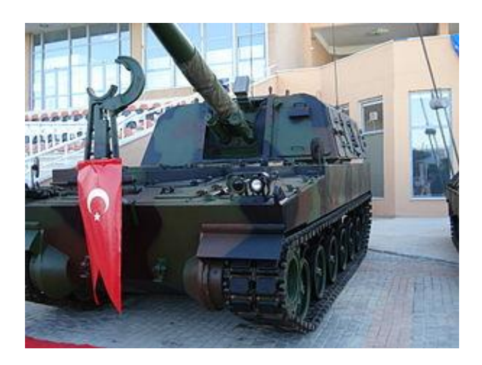
155mm Firtina self-propelled artillery

Thirdly, Turkey would enjoy army fire-support units deployed along the border area that can augment the Air Force's operations and support any friendly elements on the ground. As noted in <u>previous EDAM reports</u>, the Firtina artillery is an advanced weapon system with 40km range depending on the munitions of choice, 6-7 rounds/min rate of fire along with 3 rounds/15sec. max rate. Due to its 65km speed, the artillery can effectively accomplish fire-and-displace tactics. Thanks to the Aselsan produced inertial navigation system, the self-propelled artillery can determine the coordinates of targets with 17.5m deviation, and can open fire in 30 seconds<sup>52</sup>. Apart from the 155mm class fire-support assets, it is reported that Ankara also deployed multiple launch rocket systems (MLRS) in the border areas<sup>53</sup>.