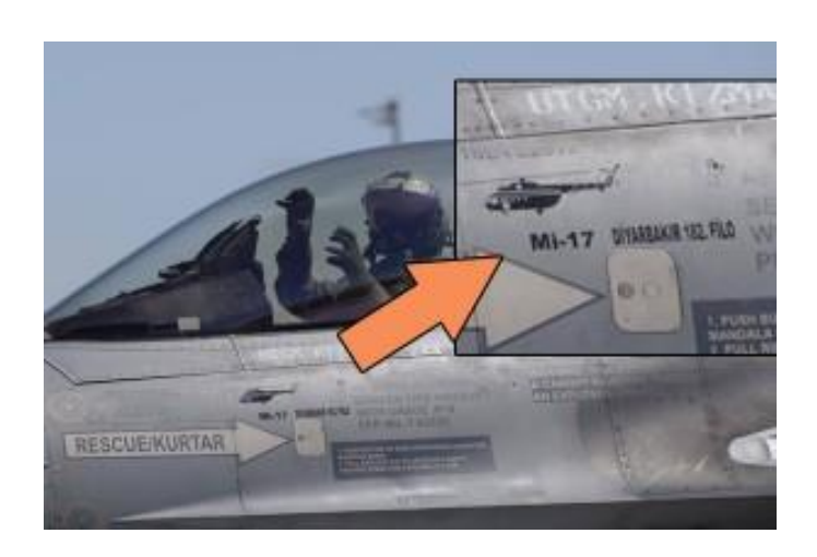
The Turkish F-16C that downed the Syrian Mi-17 Hip Helicopter with the "kill-mark"