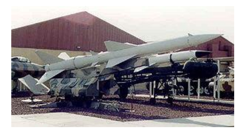
SA-2 Guideline SAM