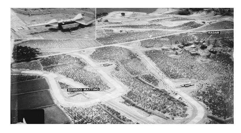
Retrieved from: <u>http://www.ausairpower.net/APA-S-75-Volkhov.html#mozTocId267156</u>, Accessed on: September 17, 2015.

<u>Verification Reference for the Syrian SA-2 SAM Site in Latakia:</u> Below SA-2 Site image photographed at low altitude by a U.S. reconnaissance aircraft during the Vietnam conflict. Circular SAM Site configuration around the radar can be clearly seen.