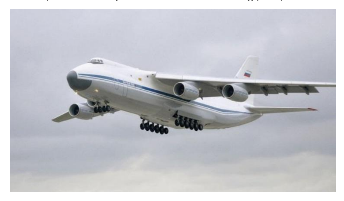
Antonov An-124, Retrieved from: http://www.janes.com/article/46548/russia-completes-initial-an-124-upgrade-programme,

124, along with the Lockheed C-5 and Boeing C-17 in the same class, is able to carry "outsize" cargos, which is different from "oversize" cargos in military airlift planning, and refers to extremely large and / or bulky items<sup>21</sup>. The airlift's advantage over sealift is first and foremost the speed when compared flights with maritime navigation<sup>22</sup>. The "speed factor" is critically important given the current state and trajectory of the Syrian civil war. Nevertheless, there is also ongoing maritime supply route from Russia to Syria, as recently surfaced by the passage of Alligator and Ropucha class amphibious transport vessels (landing ships) through the Bosphorus<sup>23</sup>. While the sea-lift between Russia and Syria is not a new development; there is an increase in the maritime supply activity.