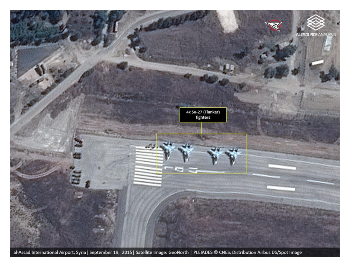
Retrieved from: <u>https://www.bellingcat.com/news/mena/2015/09/20/clarification-russian-su-30sm-in-syria-not-su-27/</u>, Accessed on: September 21, 2015.

There are also surfacing news with imagery evidence suggesting that the Russians have been deploying supermaneuverable aircraft in Syria.