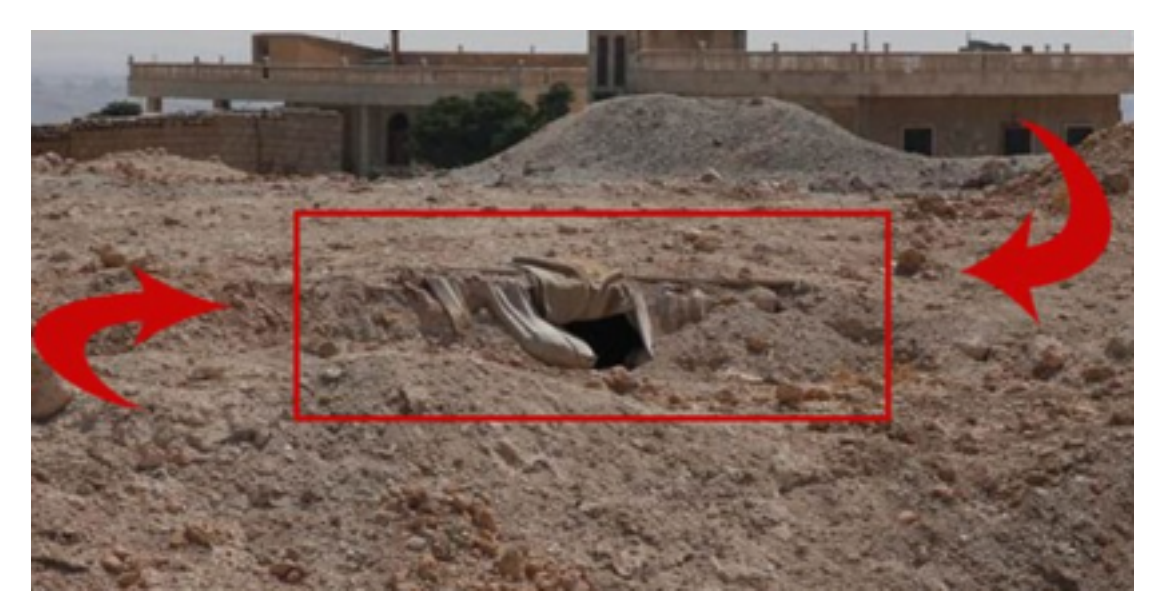
ISIS Tunnel Network Entrance (Jarablus) 44

As mentioned earlier, in case the Turkish cross-border operation manages to implement full control over the Aqil Mountain and the Hospital area, it is anticipated that the campaign will enter a new phase. Satellite imagery of al Bab suggests a densely populated urban landscape with narrow streets and congested housing. Thus, EDAM's military assessment predicts more subterranean warfare and IED intensive struggle for the second phase.